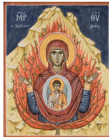
The burning bush Moses saw on Mt. Horeb (Exod. 3:2) also a type of The Mother of God

—Archpriest Lawrence R. Farley - Langley, BC