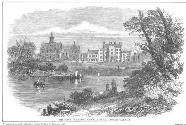
Bishop's College, Lennoxville, Quebec. c. 1865