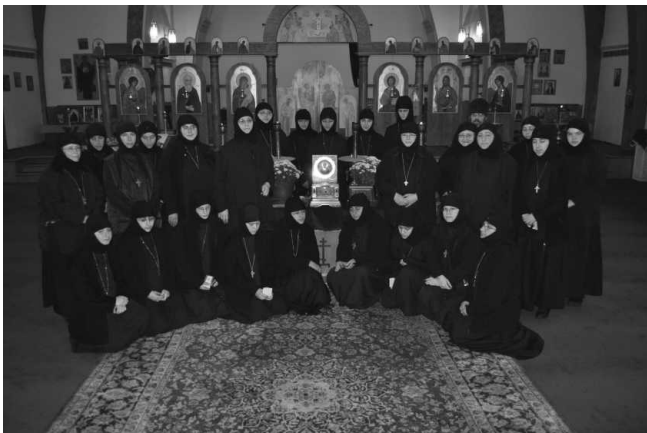
Nuns from the monastery "Panagia Parigoritissa" in Brownsburg, Quebec, venerate the relics

And also, another significant part that I mentioned on peace, even though we live in relative peace here with other Orthodox churches we cannot say that we have this really good working relationship, that we are working together on this same goal of baptising this nation into the same faith. Vladimir, even though he is a Slavic saint, he was invited by Greek churches, he was invited by Romanian churches, so the broader Orthodox community had the chance, not only to venerate, but to learn, to confirm their faith and to see that Orthodoxy is bigger than being Greek, Ukrainian, Russian: it is universal. So this is, to me, the biggest miracle that happened here.