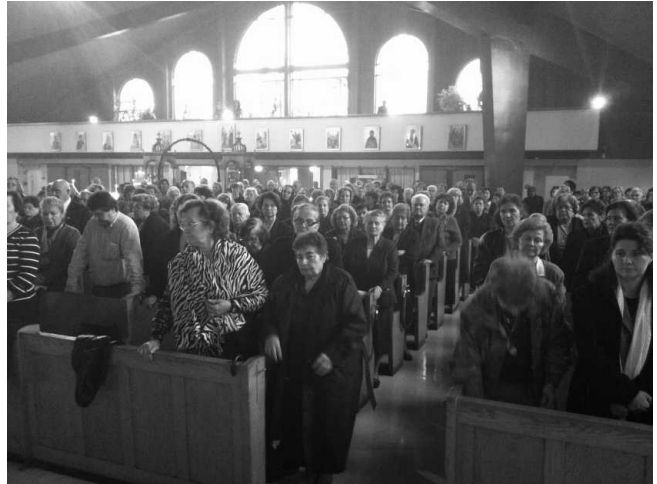
Faithful praying before St. Vladimir's relics.

responsible for this, who we can thank for this rich spiritual tradition, and, again, to make sure that our people feel their connection to the saints that gave them this faith. Also, we want to we have to cultivate the veneration of relics in North America, because we don't have many saints. And the majority of those whom we have, I mean local saints, their relics