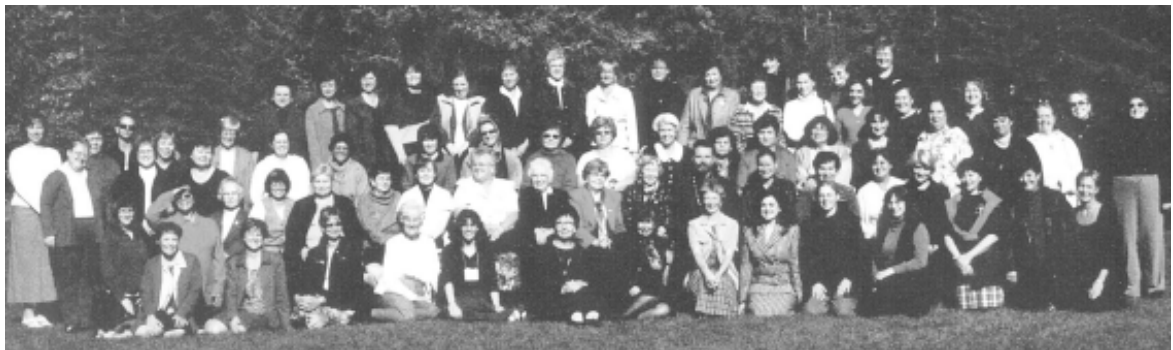
The 2003 retreatants.