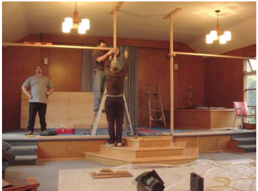
The framing begins to go up.

That's when my husband cooked up his scheme for an iconostasis in one weekend. We would plan it all out ahead of time, down to the details of who would do what as soon as they arrived. We would invite some skilled friends from other parishes on the mainland and up island; we would provide food, drink and fellowship; and we would go for it. Have them bring their kids and everything! It would build our community as well as the iconostasis. An Orthodox barn raising!