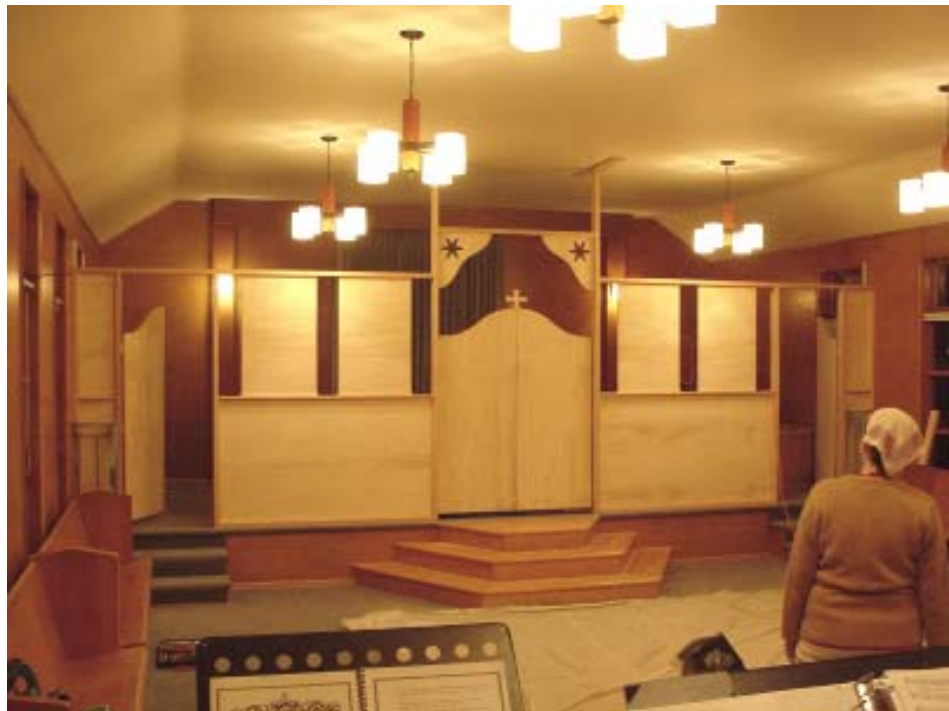
Upon completion, the iconostasis is ready for icons!

at about 1:30 am, and after staring in disbelief at the completed iconostasis and playing with the lighting for about half an hour (oh the temptation of several sets of